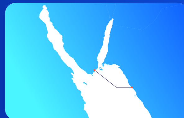
Mobily Red Sea Cable (MRSC)