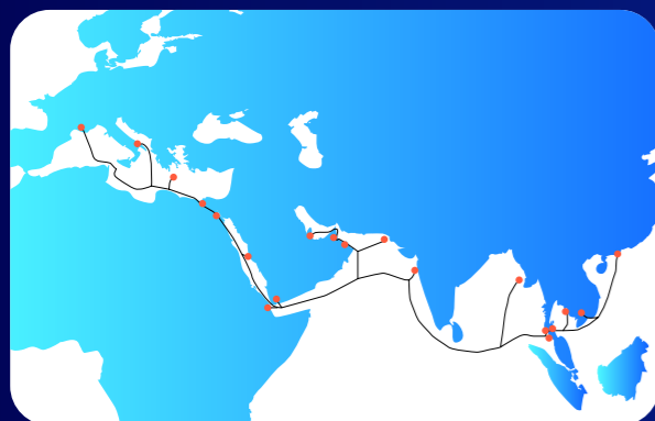
Asia Africa Europe-1 (AAE-1)

Expanded data center network capacity to more than 122MW